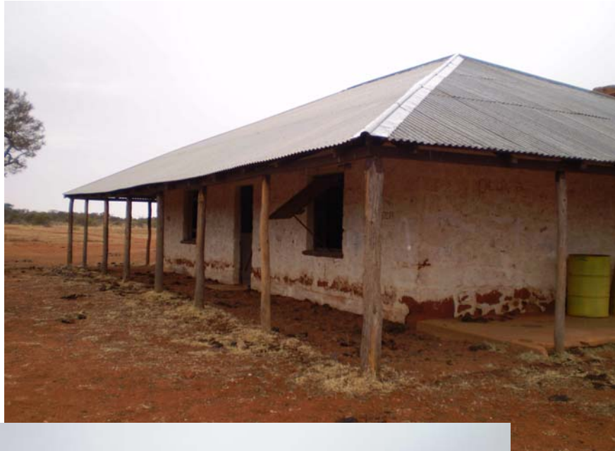
Old Mt Gould Police Station